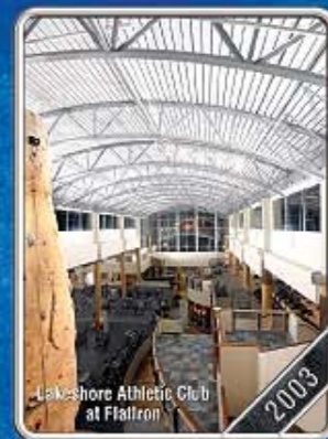
Lakeshore Athletic Club at Fallon