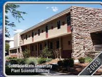
Colorado State University Plant Science Building