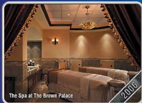
The Spa at The Brown Palace