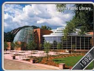
Boulder Public Library