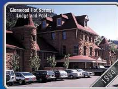
Glenwood Hot Springs Lodge and Pool