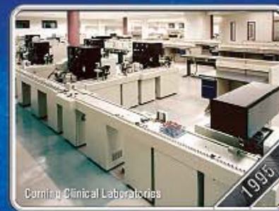
Corning Clinical Laboratories