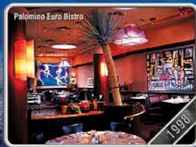
Palomino Euro Bistro