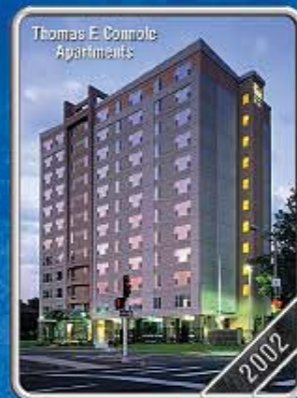
Thomas E. Conroy Apartments