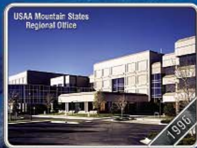
USAA Mountain States Regional Office