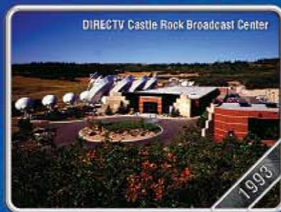
DIRECTV Castle Rock Broadcast Center