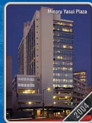
Minoru Yasui Plaza